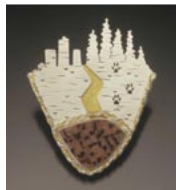
"Walking Towards Obscurity VII: Choices"; Brooch, Sterling Silver, 18 Karat Gold, Graphic Granite, 2 1/4 x 2 x 1/4".