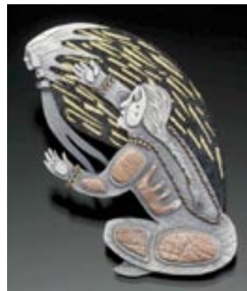
"Foggy Woman: A Dena'ina Story"; Brooch, Sterling Silver, 14 Karat Gold, Copper, Damascene (24K/Steel), 2 1/2 x 2 1/8 x 1/4".

The gestural desperation of the young man as his woman walked away, accompanied by the rain, is expressively enhanced through the inlaid gold damascene and the pierced tears falling on his cheek. Anatomy is simplified to essential forms thus intensifying the emotive impact. The textural contrasts: roller printing, engraving, inlay and twisted wire, and color variation, although subtle, artistically enrich the cultural narrative.