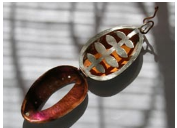
Caitlin's Locket by Caitlin Bowers